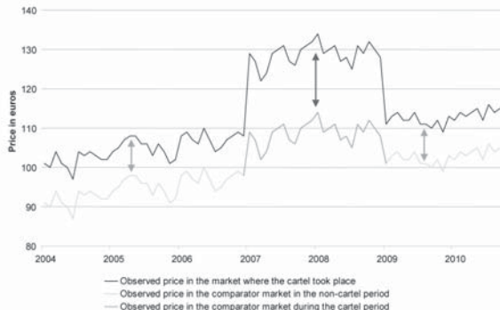
Figure 3: Illustration of the difference-in-differences method

16. From a conceptual point of view, and to the extent that the control group is sufficiently similar to the infringement market, the difference-in-differences method is an improvement over the before-after method as it isolates changes that happen at the same time as the cartel but are unrelated to it (under the condition that these changes take place in the same way in both markets). It is also an improvement over the cross-section method as it controls for differences across the affected and control markets, as long as these differences are constant over time.