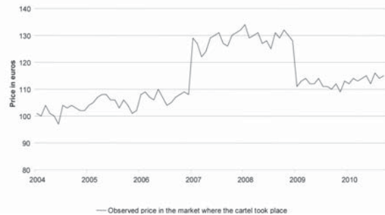
Figure 2: Stylized example of price variations before, during and after a cartel

13. Faced with this situation, one option for the plaintiff would be to argue that the price increase during the period of the cartel would constitute the cartel overcharge. This approach would be a simple application of the “before-after” method. Under such an assumption, the cartel overcharge in this example would be around 20%. An important limitation of this simple approach is that it risks attributing to the cartel price variations that are driven by other factors than the cartel. 15 It is therefore important to establish whether the assumption that all price changes observed during the cartel period are attributable to the cartel is reasonable in this case and at this stage of the proceedings. This assumption would not be validated if other important factors, such as input costs or demand, also fluctuated and explained some of the price variations observed during the cartel period.