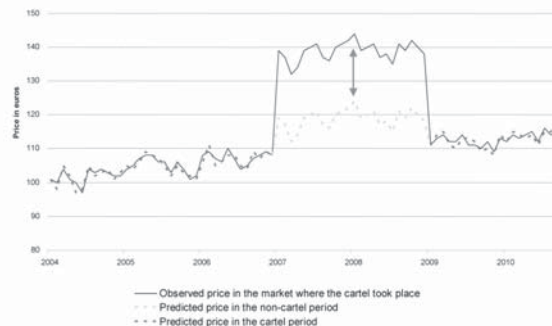
Figure 4: Illustration of observed and counterfactual prices using regression analysis

21. Regression analysis can also implement the difference-in-differences method using time-series data from both the affected and control markets. 17 This is particularly interesting as it exploits both cross-sectional and time-series variation as a source of identification. In particular, the difference-in-differences method has the advantage that it controls not only for observable variables included in the regression, but also for unobservable variables to the extent that they impact both the affected and control groups in the same manner. 18